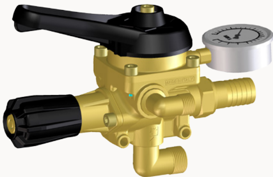
170.206.23 M170 OT Control