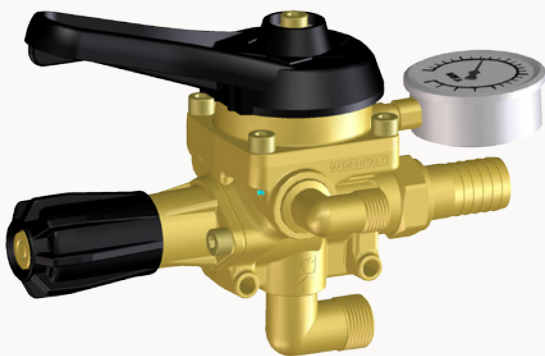
170.206.23 M170 OT Control