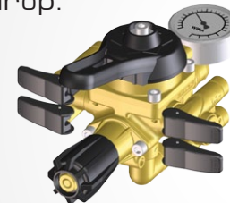
M173 valves assembly on M170 control units